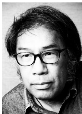
Xi Chuan ©Zheng Yang