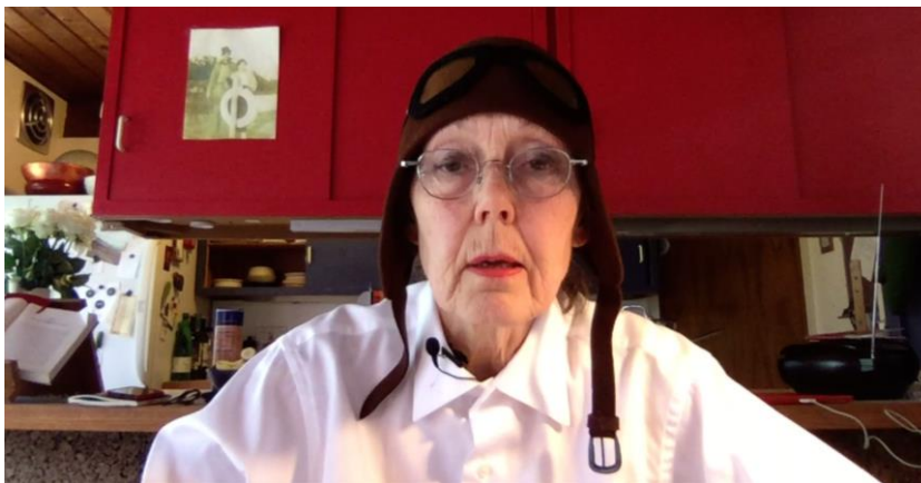
Anne Carson, Berlin Poetry Lecture

The online edition of the 21st poesiefestival berlin (5–11 June) came to a successful conclusion yesterday evening. Under the heading Planet P , 150 poets from 29 countries brought the world-wide contemporary poetry scene to the computer screens. In total, the productions were accessed around 100.000 times .