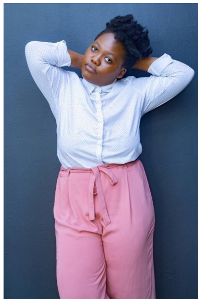
Koleka Putuma © Mawande Sobehtwa