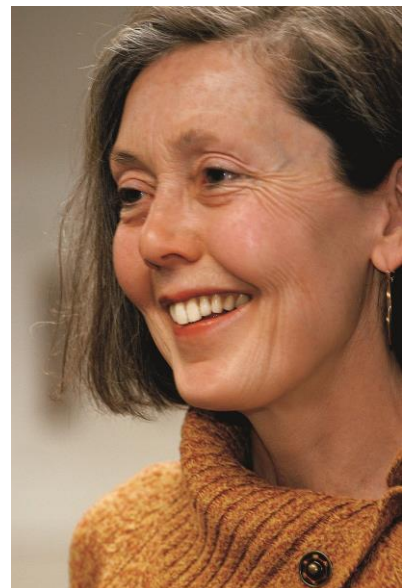
Anne Carson